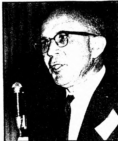
Rep. Augustus F. Hawkins

Detroit Mayor, Coleman Young testified that, "While the rest of the nation worries about recession, about six or seven or eight percent unemployment, Detroit looks