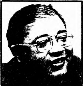
Rep. Charles Diggs

As a member of the House Committee on International Relations and chairman of its Subcommittee on International Resources, Food and Energy, I